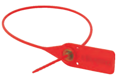
S696 Opti Seal color RED