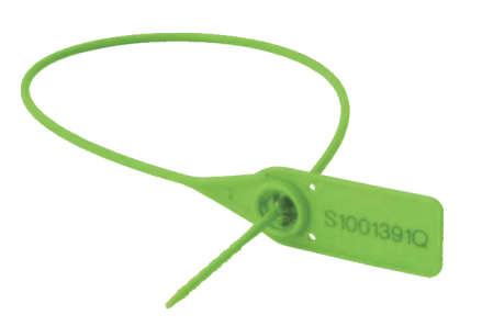
S696 Opti Seal color GREEN